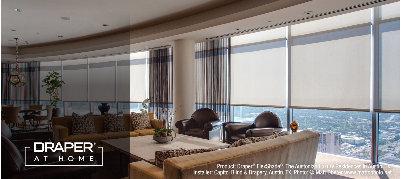
Product: Draper® FlexShade®. The Austonian Luxury Residences in Austin, TX. Installer: Capitol Blind & Drapery, Austin, TX.